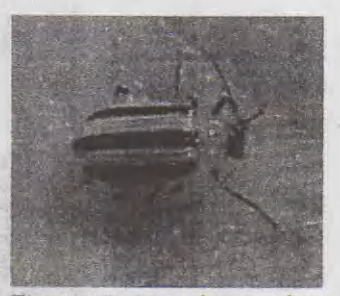
Figure 3B. Striped cucumber beetle.

vessels, producing gums that interfere with water transport. A diagnostic test for bacterial wilt is the observation of sticky ooze between cut pieces of stem after touching them together then gently pulling them apart (Fig. 3C).