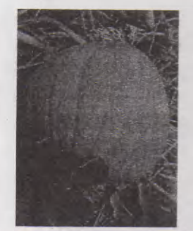
Figure 1B. Raised, scabby spots on fruit