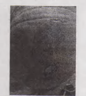
Figure 1C. Watersoaked lesions on fruit.

Bacterial fruit blotch. Bacterial fruit blotch is caused by a pathogenic bacterium (Acidovorax avenae subsp. citrulli). This is mainly an economic disease of watermelon, although other vine crops can be affected. Symptoms on leaves are often inconspicuous. On seedlings, watersoaked lesions on the underside of the cotyledons become necrotic. The typical symptom of fruit blotch is a dark olive green spot on the upper surface of the fruit. The spot starts small but rapidly increases in size to cover the most of the fruit surface within approx. 10 days. Secondary microbes then invade and result in fruit rotting.