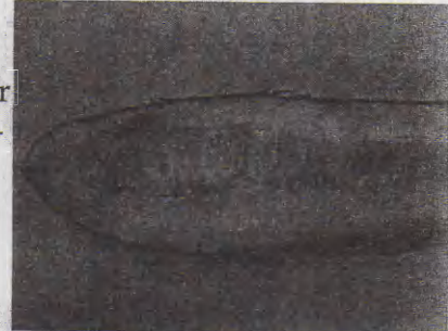
Figure 2B. Infection of cucumber fruit.

begin a small watersoaked lesions that expand on the surface and also extend well into the fruit, eventually reaching the seeds.