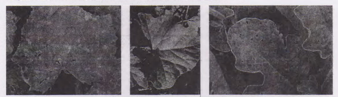
Figure 2B. Symptoms of down mildew on (left) cucumber, (middle) melon, and (right) watermelon.