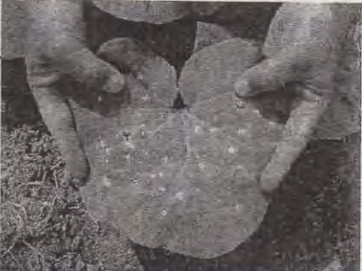
Figure 2A. Angular leaf spot lesions on a pumpkin leaf.

Angular leaf spot. Angular leaf spot is caused by Pseudomonas syringae pv. Lachrymans, a bacterial plant pathogen that is favored by cool. wet conditions. It is a very serious problem in cucumbers and other vine crops. Symptoms on leaves include angular necrotic lesions surrounded by a chlorotic halo and sunken spots on fruit. The spots