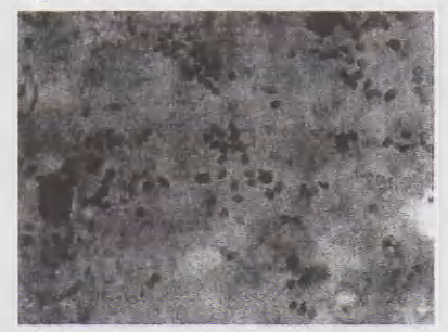
Figure 1. Sporangia on the underside of a cucumber leaf.

The causal agent of downy mildew, Pseudoperonospora cubensis, is a plant pathogen in the water mold family, which survives only associated with living cucurbit tissue. Therefore it does not survive the winter in the Midwest and must be re-introduced each year. Counties in northern Ohio and southeast Michigan appear to bear the brunt of early introductions from the north (possibly from northern cucumber production greenhouses, which may serve as a "green bridge" for the pathogen), while areas further south generally don't see the disease until late July or August. This may be due to spread from northern areas as well as introduction from the southern US. There are several different pathotypes of the downy mildew pathogen that affect vine crops differently. For example, several do not attack watermelon, pumpkins and squash, while others attack all vine crops. The types we have been seeing in the early introductions appear to be consistently aggressive on cucumber and less so on melons, pumpkins, squash and watermelon. Later introductions from the south may be more aggressive on pumpkins, squash and melon than those from the north.