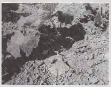
Figure 3A. Young pumpkin with early bacterial wilt symptoms.

Bacterial wilt. This disease is often observed on sunny days after vines begin to run. Individual leaves begin to droop or flag (Fig. 3A), but the plant recovers at first (see OSU Fact Sheet HYG-3121-96; http://ohioline.osu.edu/hygfact/3000/3121.html). Eventually the vine wilts and the entire plant dies. Cucumber and cantaloupes are often affected, but squash, pumpkins and less often, watermelon, are also attacked. This disease is caused by Erwinia tracheiphila and is moved from plant to plant by striped (Fig. 3B) and 12-spotted cucumber beetles. In the spring, the beetles emerge from the ground and feed on young plants, introducing bacteria into the leaves or stems and spreading the pathogen from plant to plant. The bacteria reproduce in the water-conducting