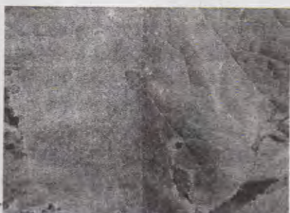
Figure 1A. Bacterial leaf spot on a pumpkin leaf