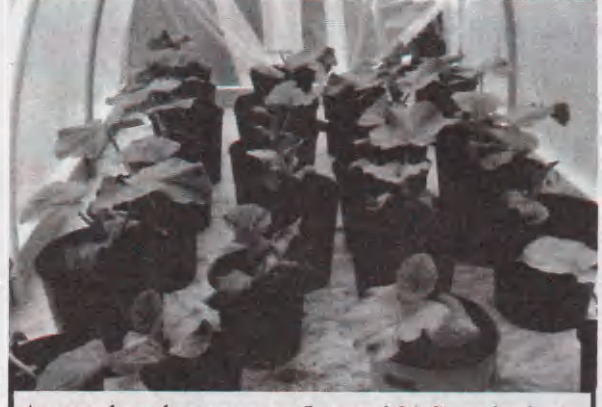
As noted on the next page I started 21 Squash plants, and was able to get 4 to produce Green Squashes.

At first I only grew two squash plants each year and back then I had a lot of trouble setting fruit. Maybe because of genetics or most likely soil conditions. After a lot of mistakes and networking with other squash growers I learned a lot of tricks of how to grow. Keep your fruit