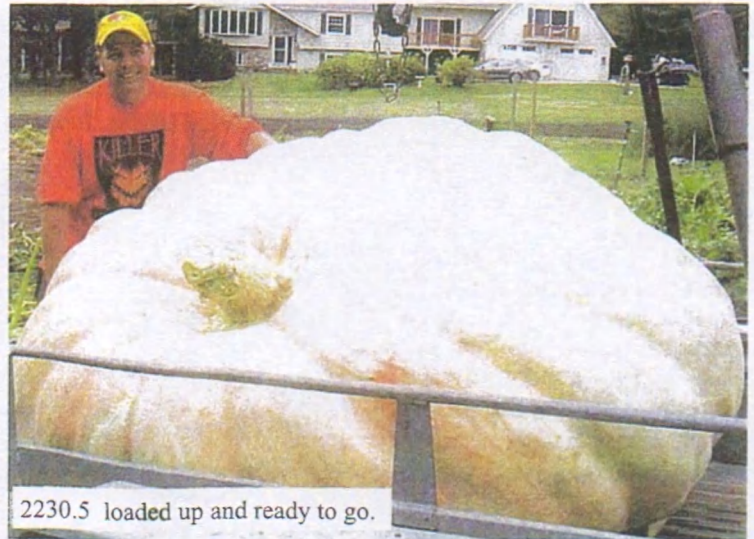
2230.5 loaded up and ready to go.

2015 was a year we will never forget, from a horrible start to a fantastic finish it was everything in between. To capture a third world championship, Grower Of The Year Award along with a new North American record is something we never thought was possible this year. Thank you to all who have sent us so many touching emails of support and congratulations. We wish everyone a safe and happy holiday season, and best of luck in 2016!